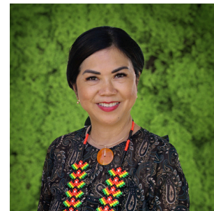
Håfa Adai, Triton Community!

Welcome to the inaugural edition of The President's Report. This newsletter will keep you updated on the latest news, achievements, and milestones at the University of Guam.