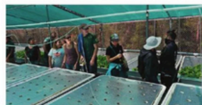
An aquaponics park reopens on the University of Guam campus by the College of Natural and Applied Sciences.

One of WPTRC's recent studies focuses on the economics and