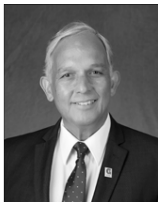
Dr. Robert Anacletus Underwood President of the University of Guam

The Honorable Robert Underwood is a former Member of the U.S. Congress and is currently the President of the University of Guam. As an educator, he has served as a high school teacher, curriculum writer, administrator, Dean of the College of Education and Academic Vice President. He is a distinguished scholar with many publications to his credit on educational issues, regional political matters and language change. He served as the Congressional Delegate from Guam in the 103-107th Congresses (1993-2003) during which he sponsored major legislation for Guam, played an active role in Department of Defense authorization bills and was a forceful advocate for political development for insular areas and the extension of educational and social opportunities for Asian Americans and Pacific Islanders.