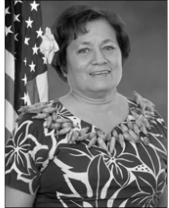
The Honorable Aumua Amata Coleman Radewagen American Samoa Delegate to the U.S. Congress

Amata has been a community activist from American Samoa who volunteers with the hospital Women's Auxiliary, is a member of Business and Professional Women and is on the board of Goodwill Industries. A 24-year cancer survivor, Amata has served as spokesperson for the Samoan Women's Health Project to promote cancer awareness and bring mammography to the territory, and has been liaison to the National Breast Cancer Coalition since 1993. She also is a member of the board of Field House 100 American Samoa, a non-profit organization devoted to finding athletic scholarship opportunities in the states for talented high school athletes in American Samoa.