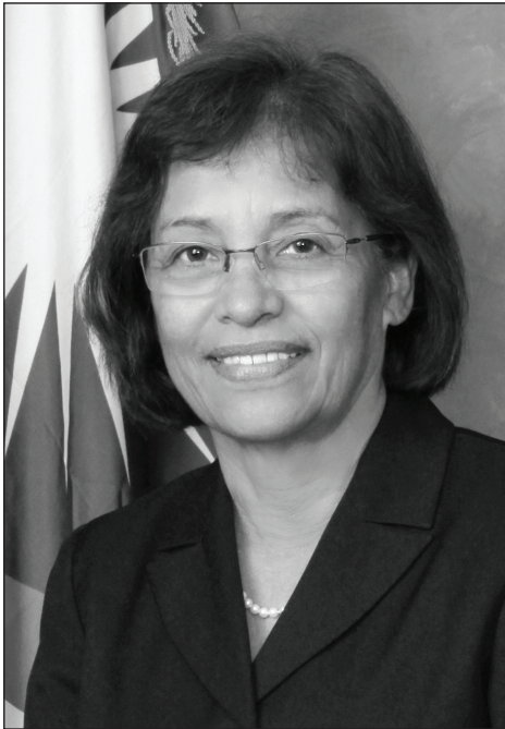
Her Excellency Dr. Hilda C. Heine President Republic of the Marshall Islands

President Hilda C. Heine is one of the three women elected to the Nitijela following the November 2015 general elections representing Aur Atoll for a term of four years. She previously served as the Minister of Education in the administration of former President Christopher J. Loek.