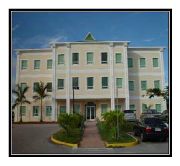
COLLEGE OF LIBERAL ARTS AND SOCIAL SCIENCES