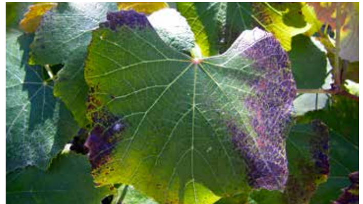
Figure 3 Purpling of the outer part of the leaf indicates phosphorus deficiency.

When compared to nitrogen and phosphorus, potassium presents very few problems for growers and the environment. It does not leach as quickly through soils as nitrogen does.