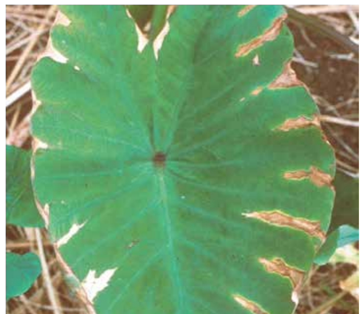
Figure 4 Potassium deficiency in 'Bun Long' taro leaf.