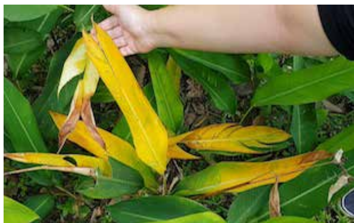
Figure 2 Yellow discoloration in leaves from nitrogen deficiency.

Phosphorus (P) is taken up by plants in smaller quantities than either nitrogen or potassium. In most soils a large portion of