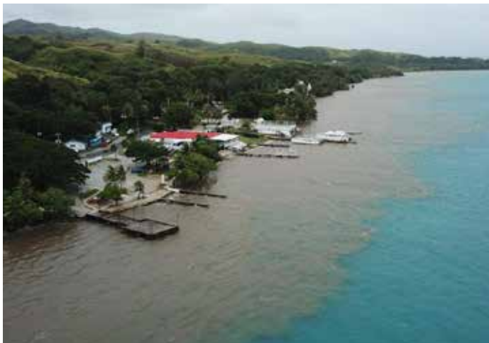
Figure 5 Runoff along the coastline of Merizo, Guam, after Tropical Storm Maria in July 2018.

Not all nutrients applied to the soil are taken up by crops, and the unused portion may become an environmental problem. The remaining nutrients may stay in the soil building up soil reserves and later become available, or they may leach through the soil or run off or volatilize into the atmosphere. Excessively high soil levels of one nutrient can affect the availability of other nutrients. In tropical conditions, all soluble nitrogen compounds are fairly quickly converted to nitrates, which move freely with soil water. Nitrogen is the most likely nutrient to become an environmental problem. Phosphorus applied to soils that is not used by plants is tied up by clay particles in the soil. The unused phosphorus remains in the soil unless it is washed off the land or carried off by soil erosion. In surface waters high phosphorus levels result in algal blooms.