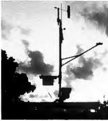
Autologging weather station installed at the Inarajan Experimental Farm. Cover design and report layout concept by Perry A. Perez.