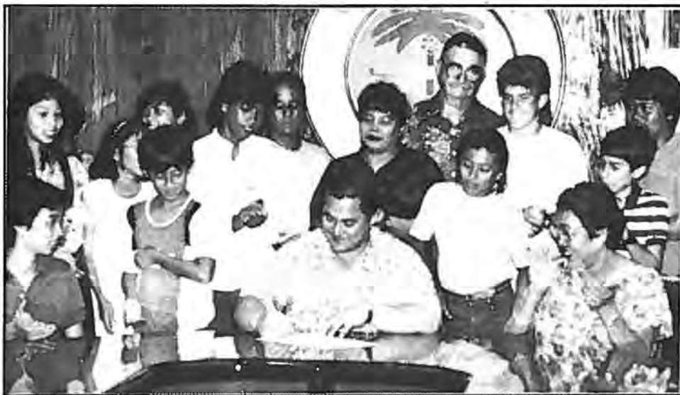
4-Hers and volunteers gather to watch as Governor Joseph F. Ada signs a proclamation declaring October as 4-H Month on Guam.

4-H & Youth Development program staff continued implementing educational programs and activities during the Fiscal Year 1988. The projects and activities completed included the following: Sewing and Textile Workshops, Summer Youth Fisheries Workshops, Teachers' Communication Workshops, Public Speaking and Listening Skills Workshops for Elementary Schools, bicycle safety workshops, Soil Conservation and Forestry Workshops, Career Programs, International Exchange, Computer and Veterinary Science workshops. In addition, two new 4-H clubs were organized; 15 elementary and middle schools participated in 4-H gardening programs; and students from three schools were taken on a guided tour of the Agricultural Experiment Station at Inarajan and research laboratories at University of Guam campus.