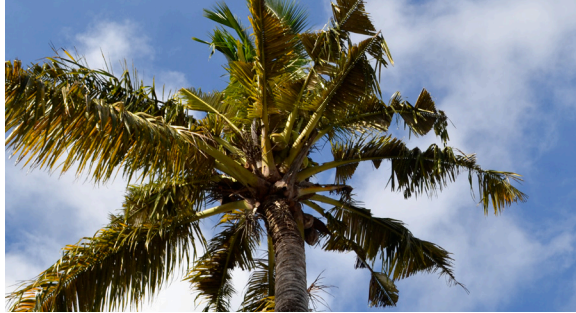
Figure 5. Leaf damage showing typical V-shaped cuts caused by the feeding of adult CRB.