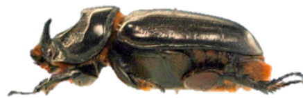
Figure 3. Female coconut rhinoceros beetle.