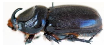
Figure 2. Male coconut rhinoceros beetle.