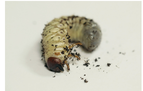
Figure 4. Third instar grub.