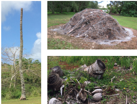
Figures 6-8. Examples of CRB breeding sites.