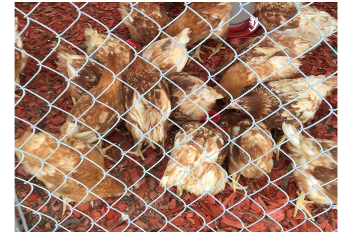
Fig. 9. Pullets on wood chip bedding.

Baby chicks are usually vaccinated at the hatchery to prevent some common viral diseases such as fowl pox, infectious bronchitis, Newcastle disease, or Gumboro. There is no cure for these viral diseases. Reducing bird density, improving ventilation, regularly adding fresh bedding/litter, and keeping feeders and water fountains clean (and sanitized) can limit bacterial diseases (such as E. coli ) and diseases caused by protozoa (such as Coccidiosis).