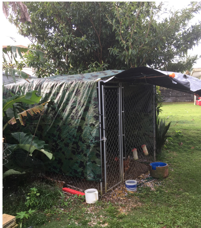
Fig. 2. Chicken housing (6 ft. wide x 10 ft. long x 6 ft. high/ Assembled weight: 106 lbs.) with canopy on sides, roof and front, and galvanized chain link and security latch.

No matter the raising style (free-range, floor, or cage), poultry must have housing that provides a secure and comfortable environment. On Guam and in Micronesia, canopies and pipes are commonly used for temporary shelter. Adding a chain link fence (with a smaller mesh) around your chickens, along with a floor that does not flood and stay damp, will provide your hens with an affordable environment for shade, and will protect your birds from predators such as cats, dogs, monitor lizards, and snakes. The model described here is a dog kennel (6 ft. wide x 10 ft. long x 6 ft. high) with a roof and additional canopy on the sides, back and front, to keep the premises dry during the rainy season (Figure 2).