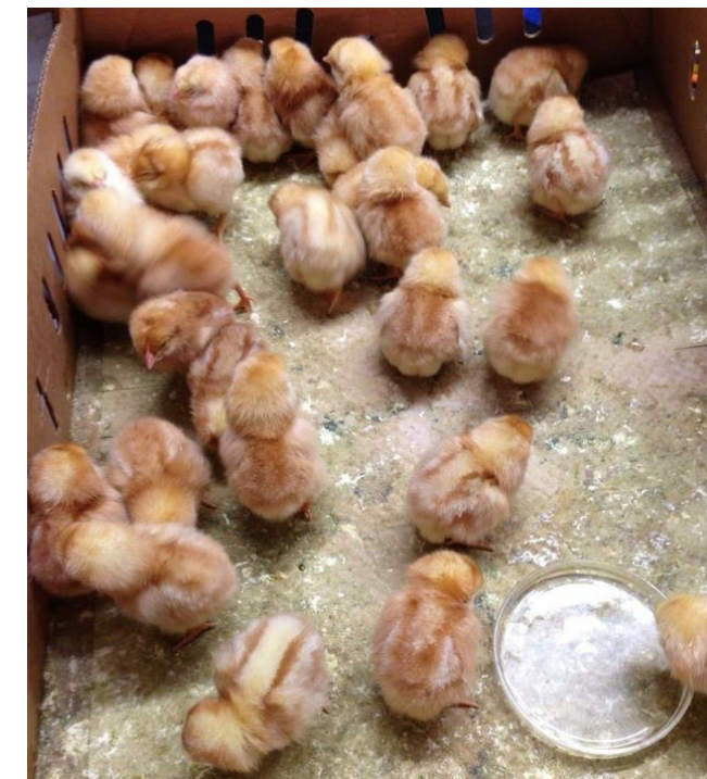
Fig. 8. Day-old chicks at arrival from post office inside shipping box.

Good sanitation practices are the best insurance against disease developing in a healthy flock! Keeping the premises dry with fresh, clean bedding/litter will improve hygiene and bird comfort. A wet and muddy litter (bedding) is a recipe for a disease outbreak. Feeders and water containers must be washed every day. Keep the facility free of rodents and insects such as fire ants. Minimize human visitors to prevent cross-contamination (because they may have been previously in contact with other fowl), and do not mix birds with other poultry such as boonie chickens, wild birds, or other fowl.