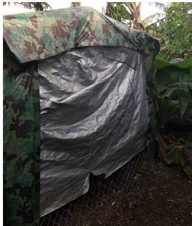
Fig. 3. Back cover of chicken housing with canopy to protect premises from rain.