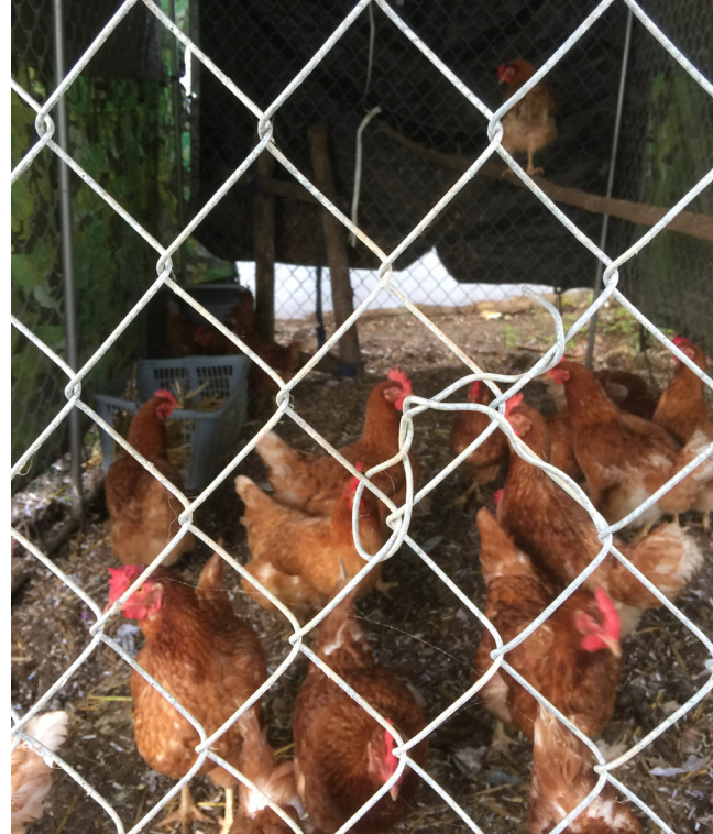
Fig. 7. Chicken on litter (straw/shredded paper/grass cuttings) with tangantangan perch.