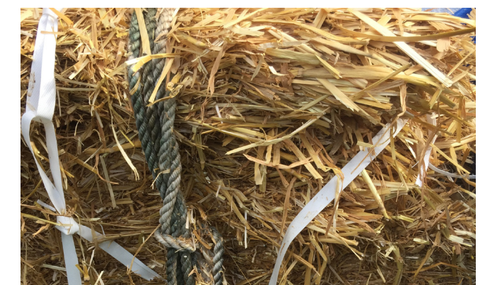
Fig. 5. Closer look at shredded paper and straw for floor bedding and nesting.