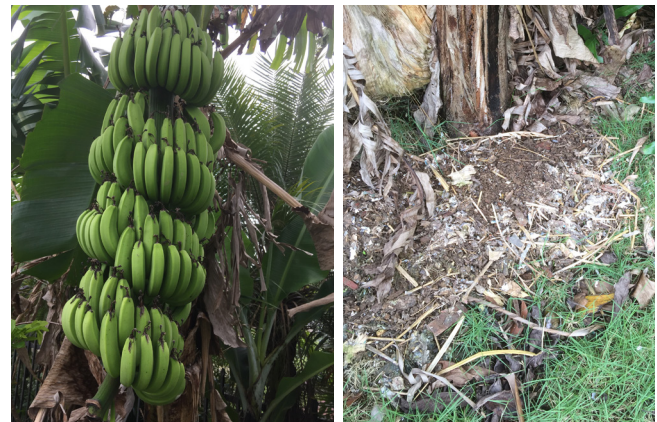
Fig. 11. Banana plant fertilized with chicken manure and litter.

The impact of this 20-layer project could improve our island's food security where one grower may provide eggs for seven households (one dozen eggs per household per week), which results in meeting about 65% of the island's need for eggs if supplied by 14% of the population engaged in this model.