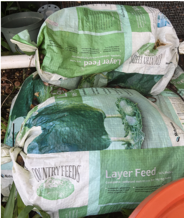
Fig. 10. Chicken manure and litter stored in 50 lbs. bags (in recycled feed bag).