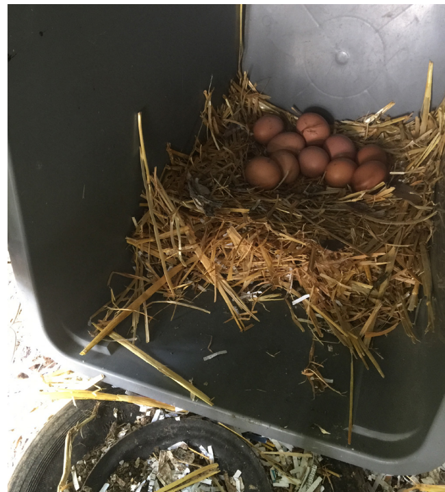
Fig. 6. Nest with closed end to provide privacy (trash can).

During the growing period (about week 8 to week 18), provide clean fresh water at all times (minimum 2 gallons for 20 birds), and feed a commercial pullet ration (3 lbs. per day for 20 birds). Avoid overfeeding the pullets to prevent premature sexual maturity and avoid unnecessary fattening of the pullets. A pullet reared with excess feed will produce eggs early, and egg sizes may be extra-small to small. Also excess abdominal fat may interfere with optimum egg production. Dry, fresh bedding/litter is added weekly at this stage. These tasks can also be done within about 10 minutes.