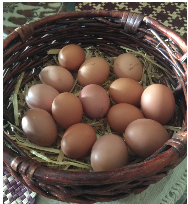
Fig. 1. Egg collection basket.

Eggshell pigmentation is a breed trait and can be generally predicted by checking the color of the earlobe (white for white shell, or red or brown for brown shell). Shell color has no effect on egg quality and is a matter of consumer preference. Just before laying, eggs are naturally lubricated with a waxy cuticle, which evaporates in a few