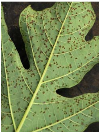
leaf spot Asperisporium fungus, papaya