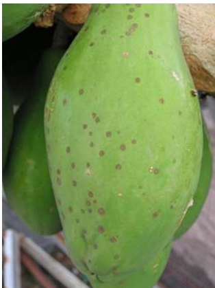
fruit spot Asperisporium fungus, papaya