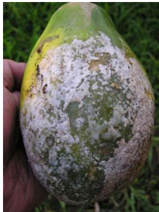
fruit rot Phytophthora , papaya