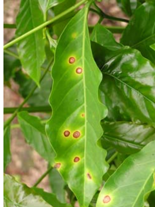
leaf spot Cercospora fungus, coffee