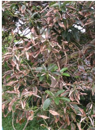
scorch abiotic symptom, avocado