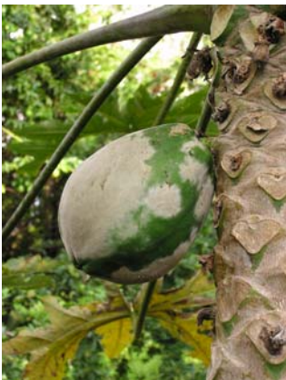
powdery mildew fungus, papaya