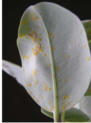
rust fungus, 'ōhi'a