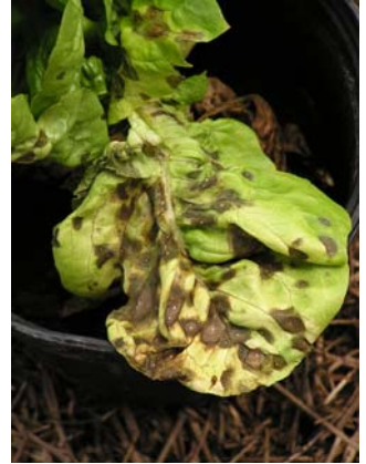
leaf spot Cercospora fungus, lettuce