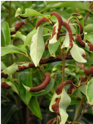
erinoise mite lychee