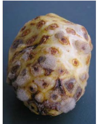
postharvest rot Rhizopus fungus, noni