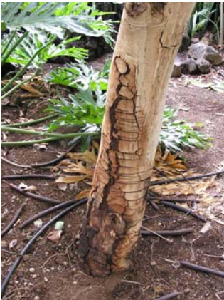
canker fungus, shower tree