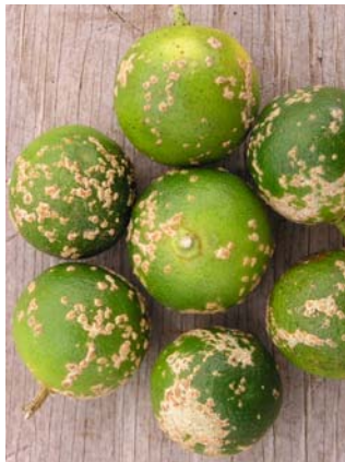
scab (fungal scab) Elsinoe fawcettii , citrus