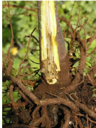
necrosis (internal stem) Verticillium fungus, naupaka