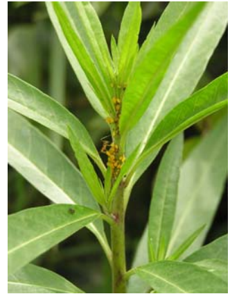
aphids tended by ants, oleander