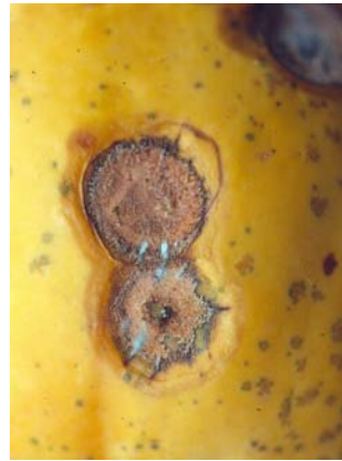
fruit rot anthracnose fungus, papaya