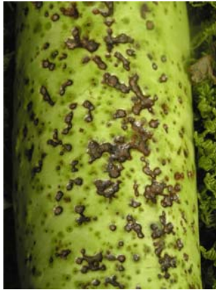
fruit rot anthracnose fungus, cucurbit