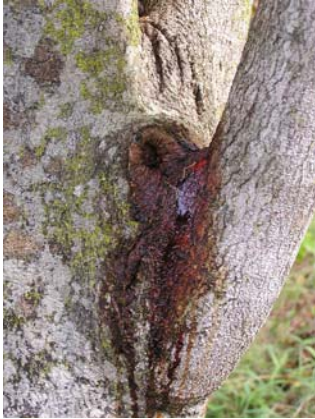
gummosis shower tree