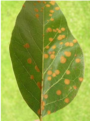
algal leaf spot avocado