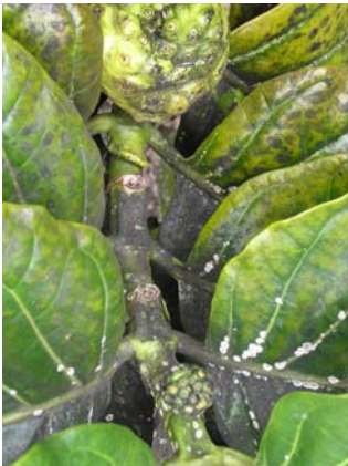
sooty mold fungus, noni