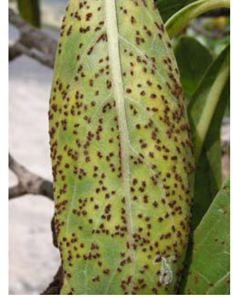
rust fungus, heliotrope