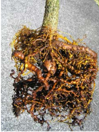
root-knot galls from nematodes, noni