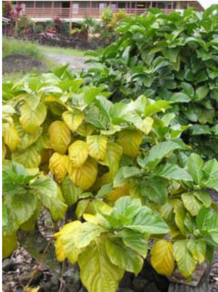
chlorosis (yellow leaves) root-knot nematode, noni