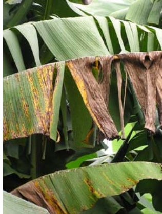
leaf blight (black leaf streak) Sigatoka fungus, banana