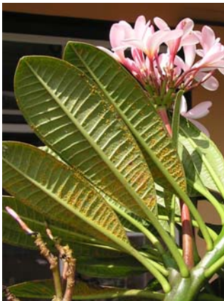
rust fungus, plumeria