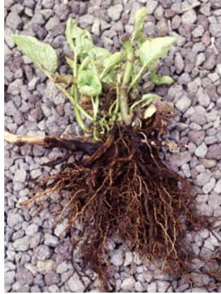
root rot Pythium , 'awa (kava)