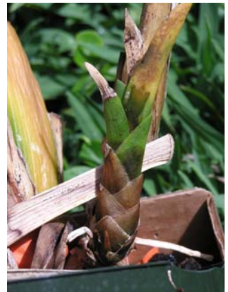
soft rot bacteria, orchid