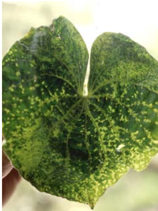
mosaic cucumber mosaic virus, 'awa