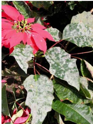
powdery mildew fungus, poinsettia