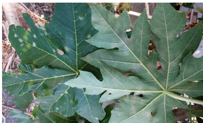
Figure 6. Powdery mildew on the lower and upper surfaces of papaya leaves