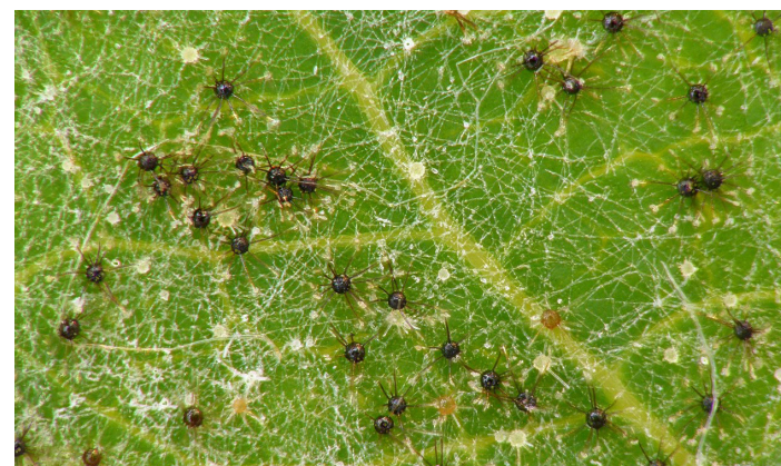
Figure 2. Example of what chasmothecia of a powdery mildew fungus look like under a 14X hand lens

After a spore lands on a leaf surface, it germinates and produces thin thread-like branching filaments called hyphae. En masse they form the mycelium, which comprise the vegetative (non-sporulating) body of the fungus. Some of the hyphae will develop into specialized cells called conidiophores (8-15 \mu\text{m} wide x 40-132 \mu\text{m} long) (Fig. 1, 3, &4). It is from these upright, simple conidiophores that chains of conidia (asexual spores) are produced (Fig. 1, Fig. 3). A single chain may consist of 3-5 spores. Conidia are large (16-29 \mu\text{m} wide x 32-46 \mu\text{m} long), ovoid, single-celled, and clear (Fig. 4). Mycelium and conidiophores are produced mainly on the upper leaf surface, where en masse they can be easily seen as various sized patches of white powder. Over time these patches turn grayish and may become dotted with fruiting structures 80-150 \mu\text{m} in diameter. Chasmothecia are small, pinhead-sized, spherical structures that are initially white and later turn black with age (Fig. 2).