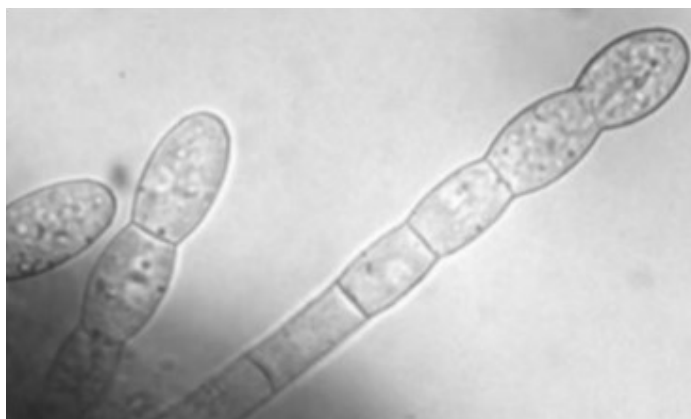
Figure 4. Conidia and conidiophores of a powdery mildew fungus