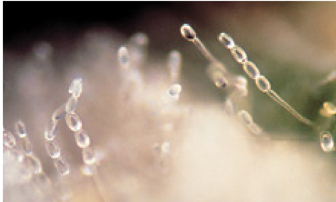
Figure 3. Conidiophores of a powdery mildew fungus with conidial chains