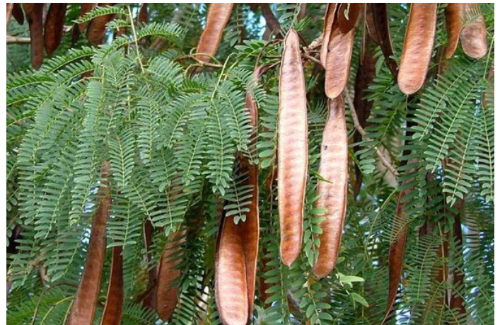
Figure 5. Leucaena leucocephala , tangantangan, is a naturalized tree to Guam used for nitrogen fixation.