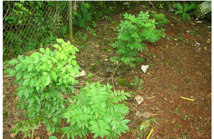
Figure 4. Row of Gliricidia sepium used for hedgerows.

nitrogen fixation. This process allows the plant to receive the nitrogen needed for plant growth. It is important to know that for this process to be effective, the proper species of nitrogen-fixing trees need to be selected to match the strain of Rhizobia .