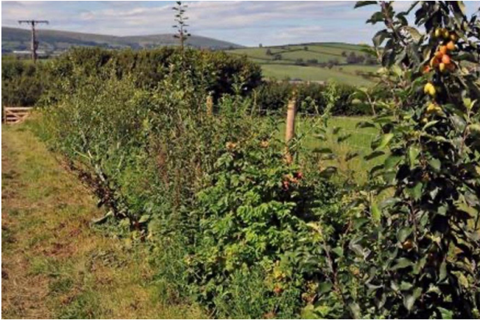
Figure 1: Example of hedgerow conservation practice.