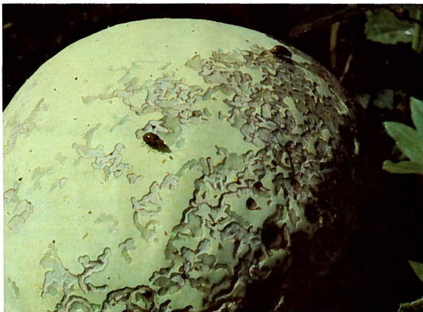
Fig. 1a Cucumber beetle feeding on watermelon