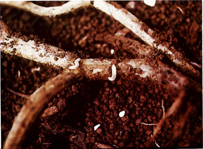
Fig. 2 Cucumber beetle grub tunneling into the cucumber roots

Control: Insecticides (such as Sevin) should be applied immediately after noticing the beetles in the field. Any delay in controlling the adult beetles will result in the beetles laying eggs and the grubs entering the roots of the plants. It is much more difficult to control the grubs inside the roots, than the adults on the surface of the leaves.