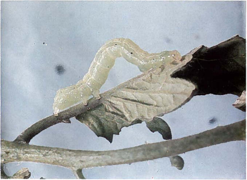
Fig. 12 Garden looper caterpillar

Garden looper: Chrysodeixis chalcites (Esper)