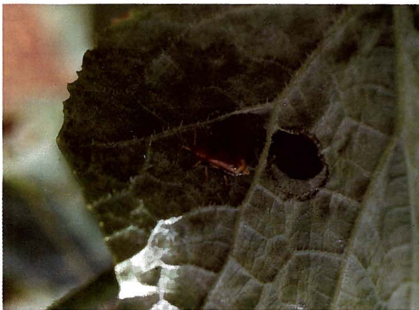
Fig. 1b Cucumber beetle feeding on cucumber leaf