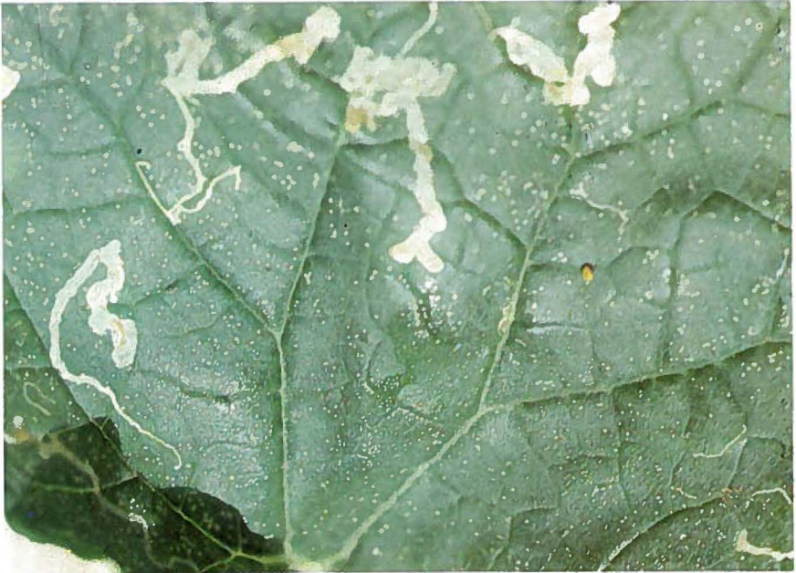
Fig. 7 Leaf miner tunneling into a cucumber leaf