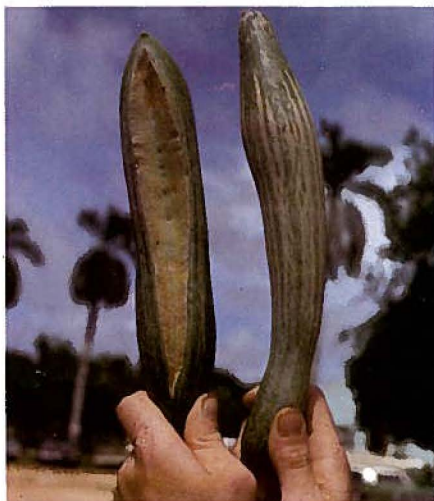
Fig. 16 Broad mite damage expressed on mature cucumber fruit