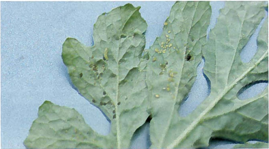
Fig. 4 Melon aphid on watermelon leaf