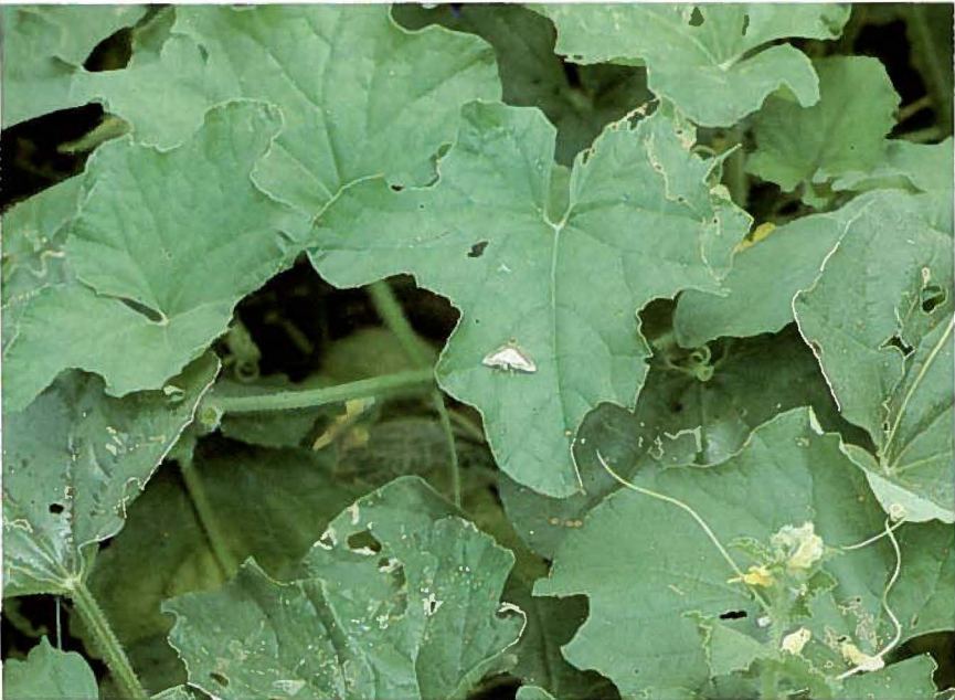
Fig. 9 Adult of melon leaf caterpillar