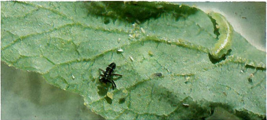
Fig. 5 Lady beetle larva and syrphid fly maggot feeding on aphids