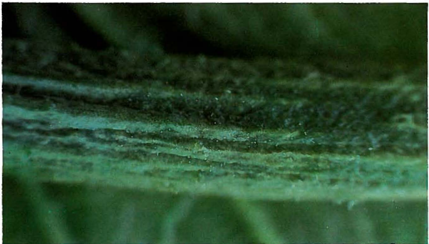
Fig. 15 Broad mites on a tender cucumber