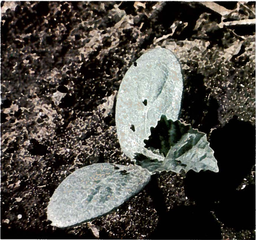
Fig. 6 Leaf miner adults on cucumber seedling