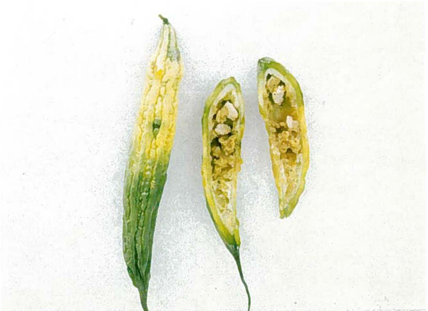
Fig. 3 Melon fly maggot feeding on fruit pulp

The adult female lays eggs in groups inside the fruit. Each female is capable of laying over 100 eggs. Eggs hatch two to three days after laying. Maggots tunnel into fruit and feed on the pulp (Fig. 3). Fully grown maggots wriggle out of the fruit and drop on the surface of the soil. Later, they burrow themselves about 2 to 5 cm below the surface and undergo pupation. Pupae are barrel-shaped, yellow in color in the beginning, and turn brown before emergence. The pupal stage lasts for about a week.