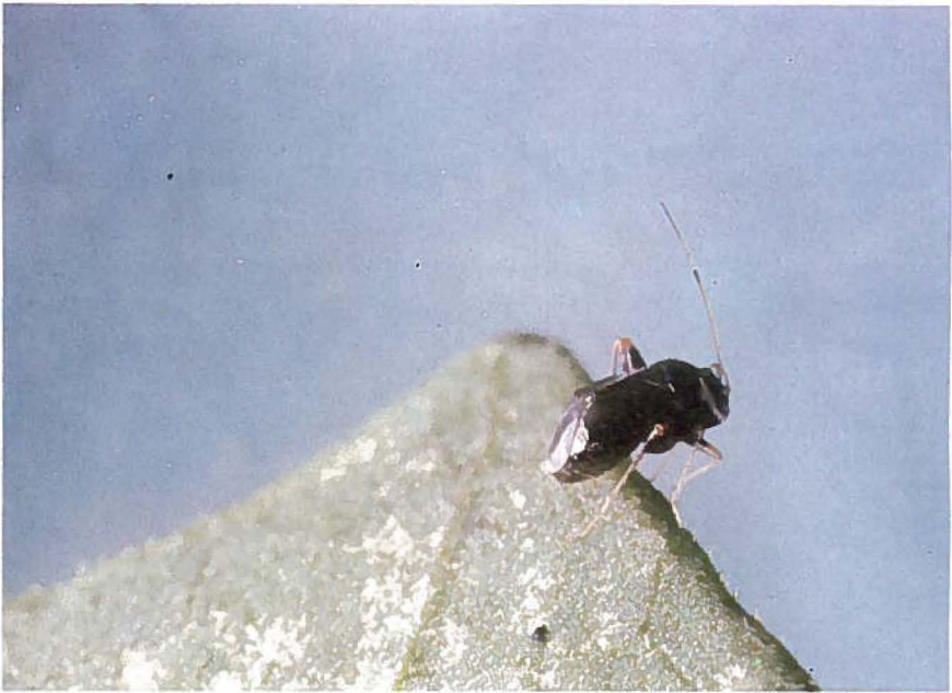
Fig. 13 Flea hopper

Control: Spraying with one of the common pesticides will control this pest.