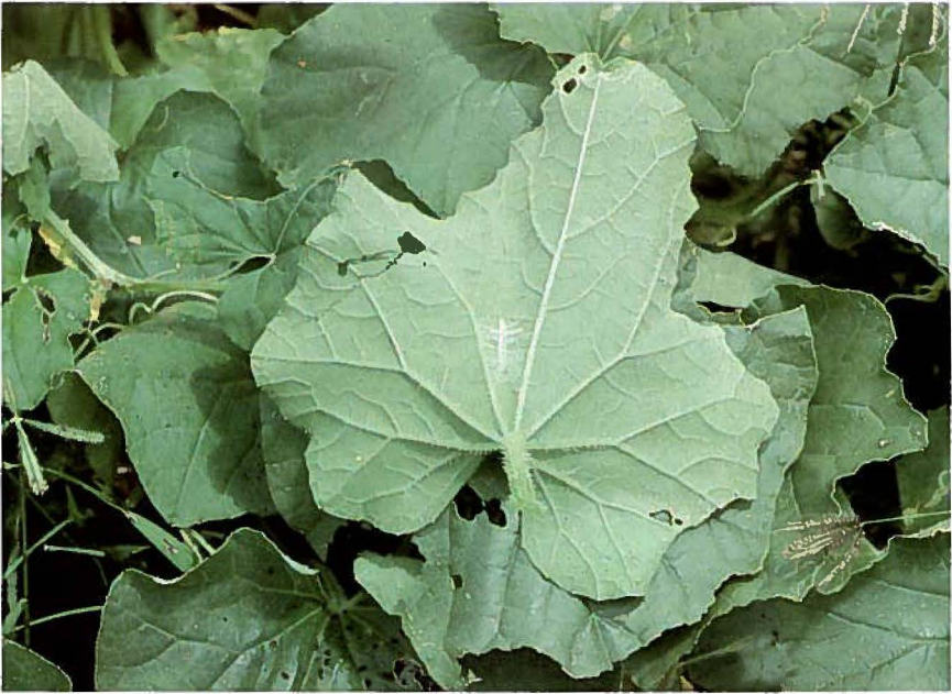
Fig. 8 Melon leaf caterpillar on the under side of a cucumber leaf