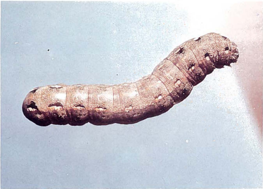
Fig. 11 Cutworm caterpillar