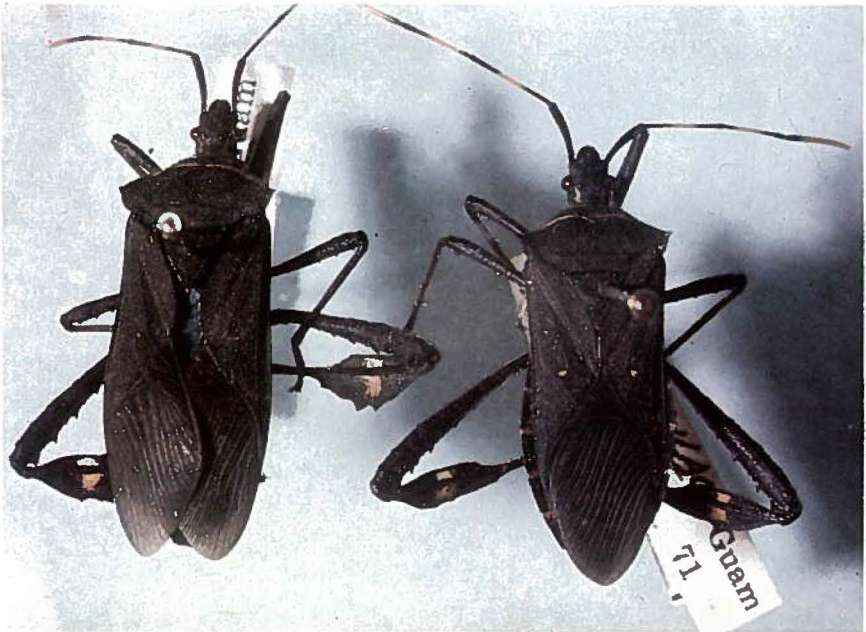
Fig. 14 Leaf-footed bug

Leaf-footed bug: Leptoglossus australis (F.)