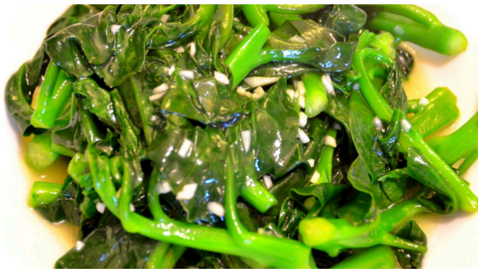
Figure 4. Malabar spinach as a cooked dish