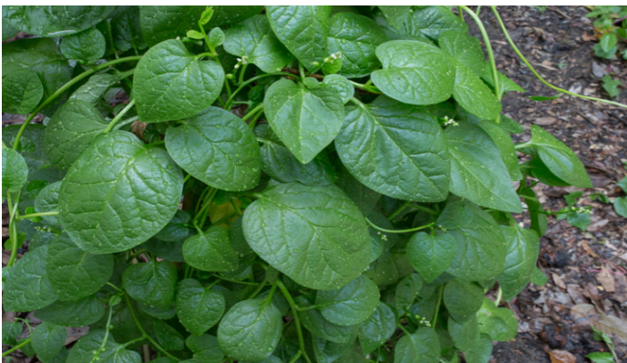
Figure 1. Variety green of Malabar spinach Basella alba .

Malabar spinach ( Basella alba ), also known as vine spinach, Ceylon spinach, Indian spinach, and climbing spinach, is a tropical perennial vine native to tropical Asia. Although Malabar spinach is not a true spinach, it is primarily consumed like true spinach (leaves and stems). There are two main varieties of Malabar spinach, one with green stems and leaves (Figure 1), and another variety containing reddish-purple stems (Figure 2). The reddish-purple variety is known as 'Rubra' and sometimes referred to as Basella rubra (Hanumappa, 2019). Both varieties of Malabar spinach can be found growing in small agroforestry systems in Guam.