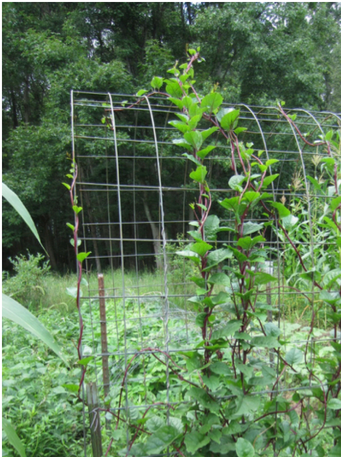
Figure 3. Malabar spinach supported by trellising.