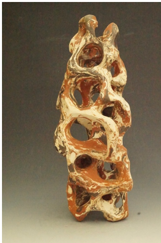
A clay sculpture by Lewis Rifkowitz