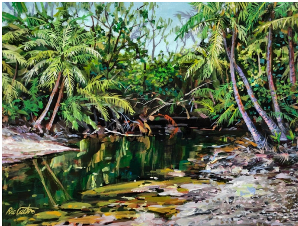
"Cetti River Outlet," an acrylic painting by Ric Castro