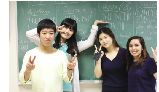
CULTURAL BEACH DAY