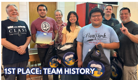
1ST PLACE: TEAM HISTORY