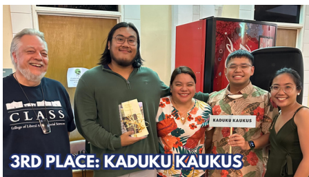
3RD PLACE: KADUKU KAUKUS