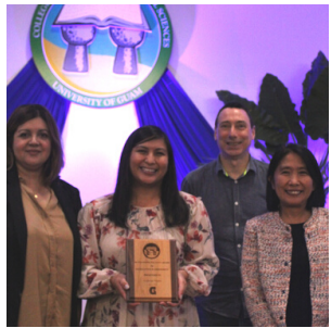
Excellence in Assessment Psychology Program