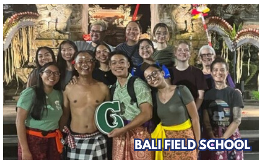
BALI FIELD SCHOOL