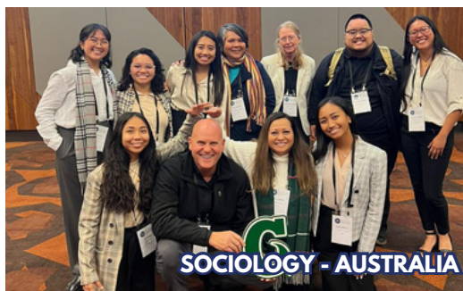
SOCIOLOGY - AUSTRALIA