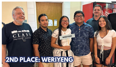
2ND PLACE: WERIYING