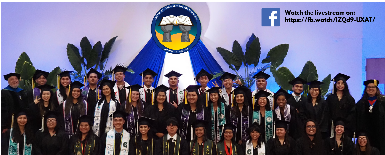
College of Liberal Arts and Social Sciences Fañomnåkan 2023 graduates at the CLASS Pinning Ceremony held at the CLASS Lecture Hall on May 12, 2023.

Watch the livestream on: https://fb.watch/IZQd9-UXAT/