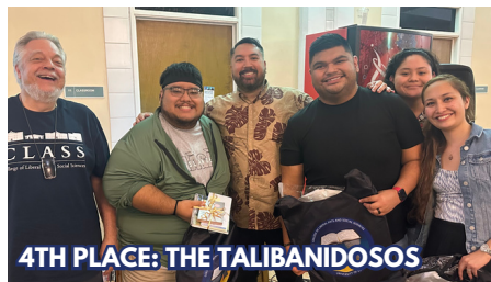
4TH PLACE: THE TALIBANIDOS