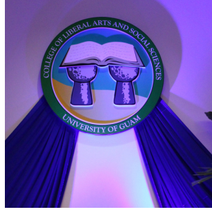
Outstanding Staff Evelyn Siquig not pictured