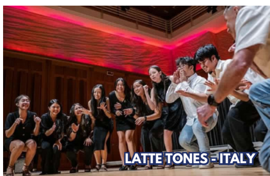
LATTE TONES - ITALY