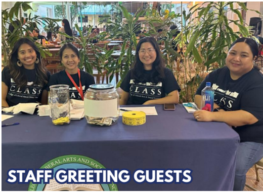
STAFF GREETING GUESTS