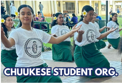
CHUUKESE STUDENT ORG.