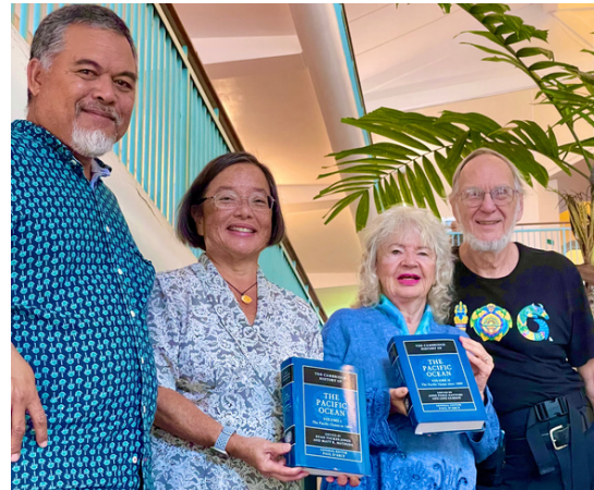
THREE UOG FACULTY CONTRIBUTE TO "THE CAMBRIDGE HISTORY OF THE PACIFIC OCEAN"