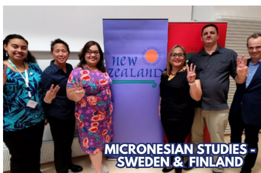
MICRONESIAN STUDIES - SWEDEN & FINLAND