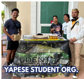
YAPESE STUDENT ORG.