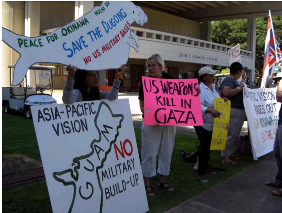
Figure 3. Activists seek demilitarization. on January 10, 2010.