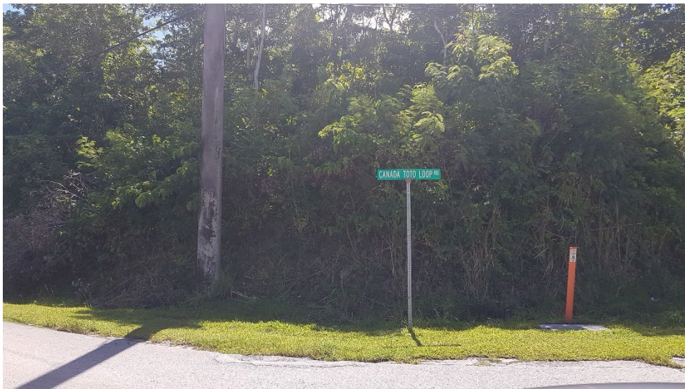
Chalan Cañada, one of the areas of To'to where bamboo is abundant