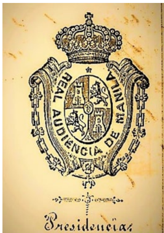
Seal and Letterhead Real Audiencia de Manila, 1886

Article 489 of the Law of Criminal Prosecution, each Court of First Instance ( Juzgado de Primera Instancia ) was required to have the assistance of a forensic medical examiner, whenever this was requested by the coroner.