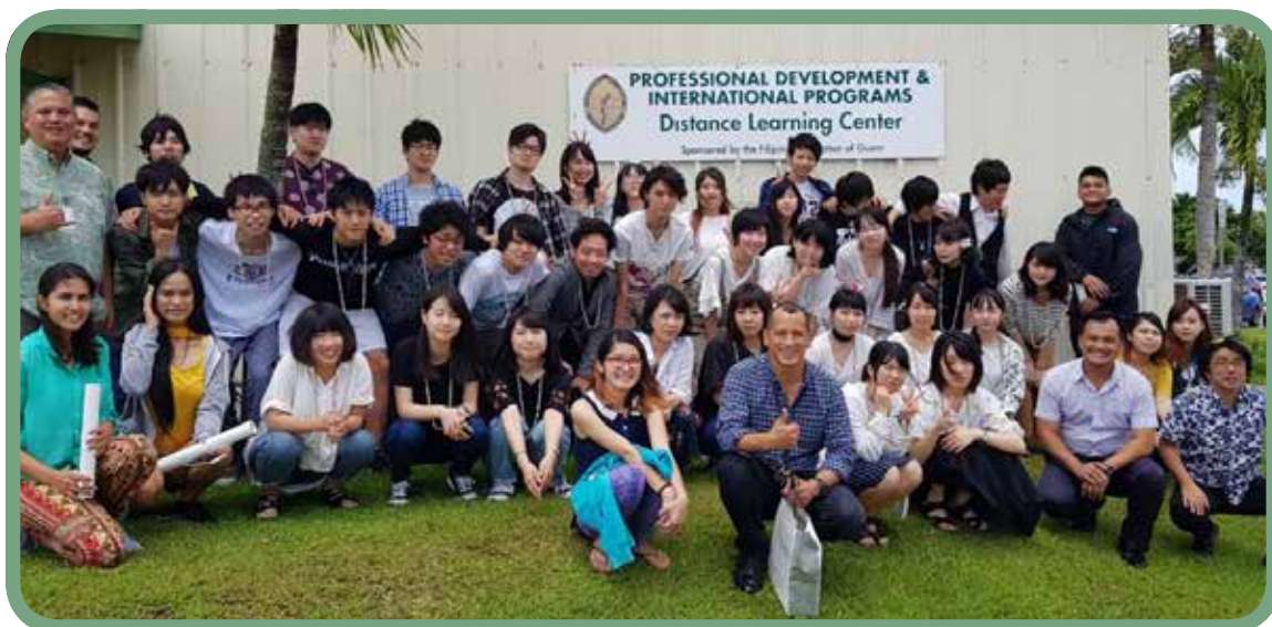
Students from the Niigata College of Art & Design (NCAD) participated in the University of Guam's (UOG) award winning English Adventure Program on Wednesday, September 27, 2017.