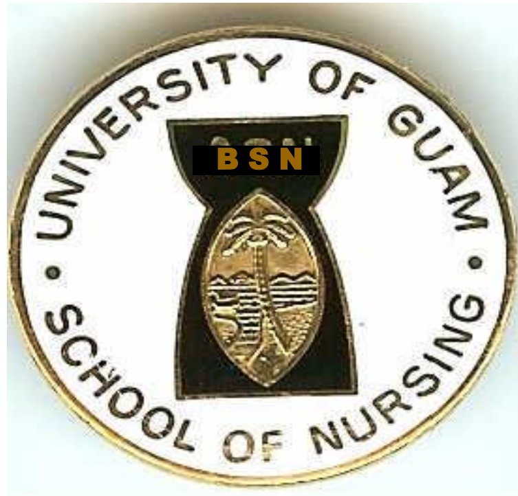
PHOTO OF BSN PIN