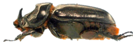
Figure 3. Female coconut rhinoceros beetle.